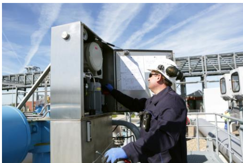
Electrical work on a natural gas facility

Cadent owns, operates and maintains the largest natural gas distribution network in the United Kingdom, transporting gas to 11 million homes and businesses across East & West Midlands, North West of England, East of England and North London.