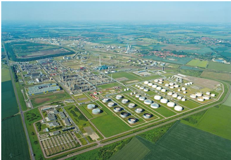
Bilfinger is responsible for the maintenance of large parts of the approximately 320-hectare plant complex