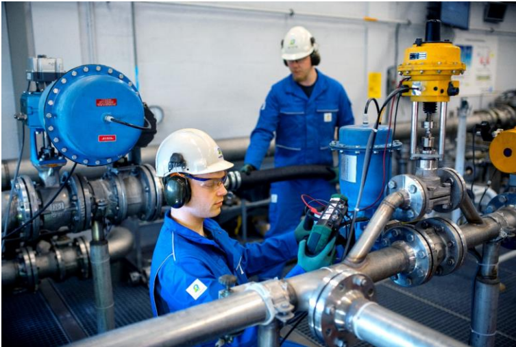
Bilfinger manufactures and lays the pipelines, and installs equipment and electronics for the wastewater treatment systems of a new semiconductor factory in Germany. Illustrative photo.

Bilfinger is an international industrial services provider. The aim of the Group's activities is to increase the efficiency and sustainability of customers in the process industry and to establish itself as the number one partner in the market for this purpose. Bilfinger's comprehensive portfolio covers the entire value chain from consulting, engineering, manufacturing, assembly, maintenance and plant expansion to turnarounds and digital applications.