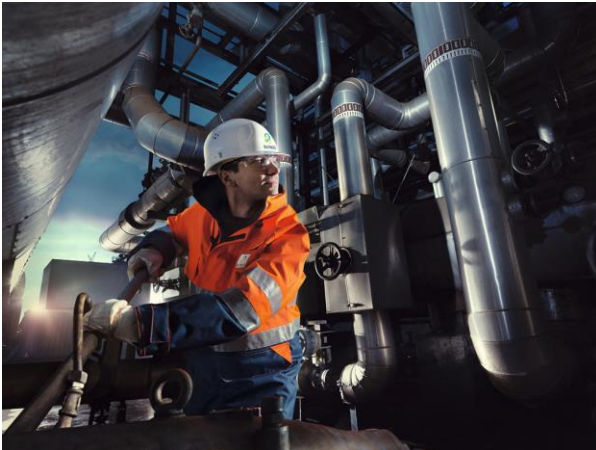
Bilfinger will continue to provide a range of maintenance and project services at Innospec's Ellesmere Port site

Bilfinger is an international industrial services provider. The aim of the Group's activities is to increase the efficiency and sustainability of customers in the process industry and to establish itself as the number one partner in the market for this purpose. Bilfinger's comprehensive portfolio covers the entire value chain from consulting, engineering, manufacturing, assembly, maintenance and plant expansion to turnarounds and digital applications.