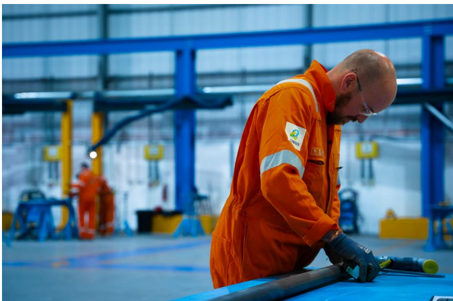
Bilfinger supports its customers with extensive expertise in pipework fabrication