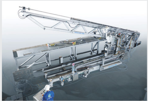
Damaged Fuel Table