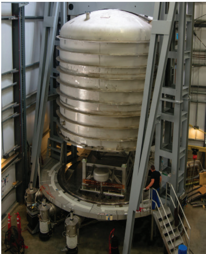
Final Test Cryostat for the Central Solenoid Modules for ITER